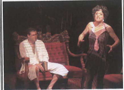
Norma- "I told you both DeMille would jump at it!"