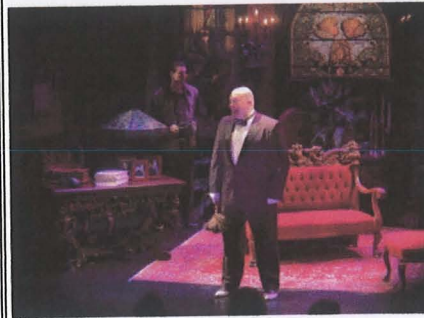
Max- "Madame will be right down."