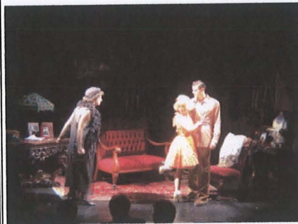
Norma- "But does he love you?"