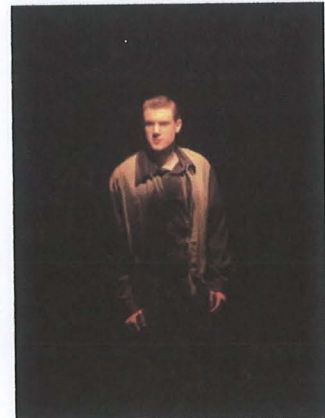
Joe- "The neighbors at night with their pounding head board slamming the wall..."